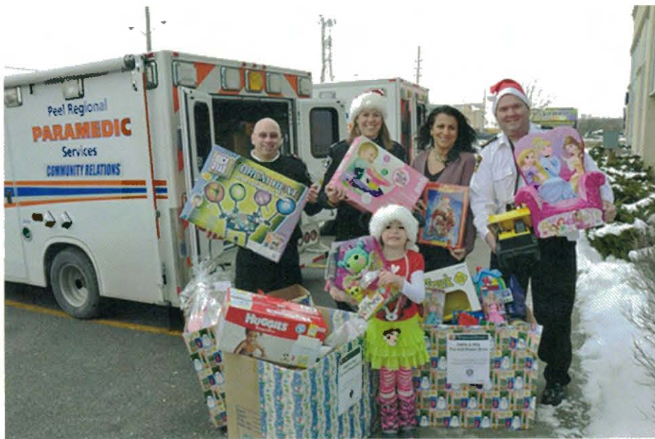
Our ambulances full of toys and diapers