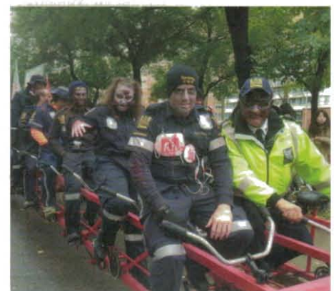
The TPA participated in the CPR Makes you Undead campaign.